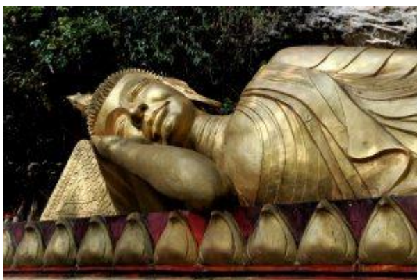
Laotian lying Buddha