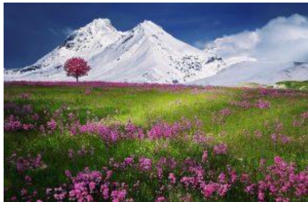
Alpine meadow

In this way the inner as well as the outer cycle of existence, “Samsara”, or suffering is ending!