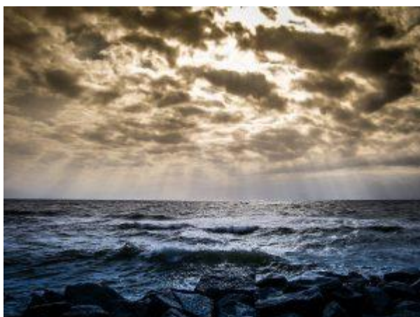
The elements water, air and light

May we all be with the true home, the true protection and the true power of the universal "Source"!