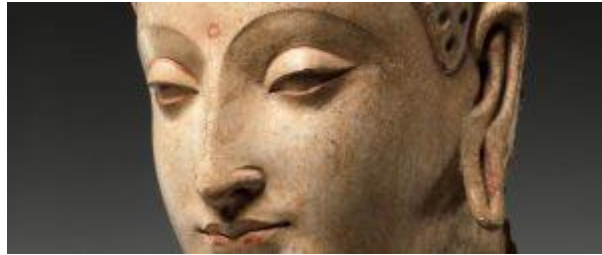
Old Indian „Greek“ female Buddha statue of the "Gandhara" art style of the Greco-Indian kingdoms