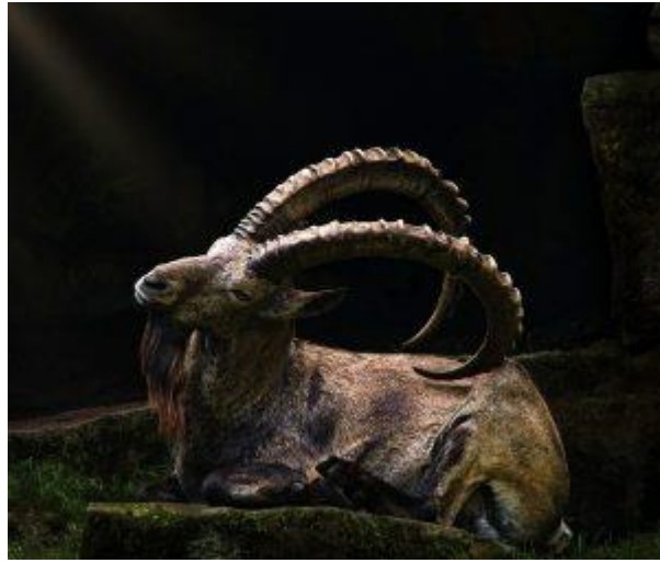
Steinbock (Freies Bild)