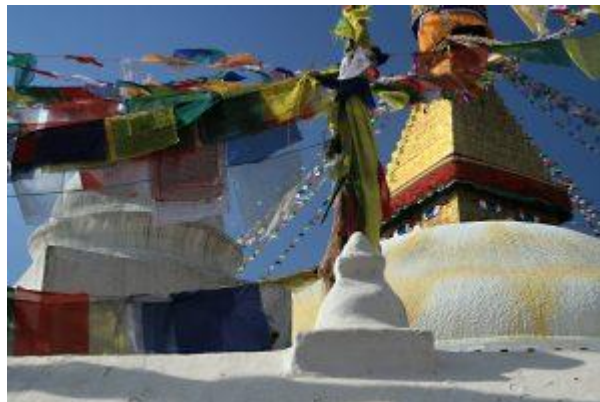
Stupa with the seeing Buddha eyes

The Bodhisattvas "oscillate" between that "Oneness Consciousness" as the source of their liberating activity and that "Voidness Consciousness" as the source of their Awakening.