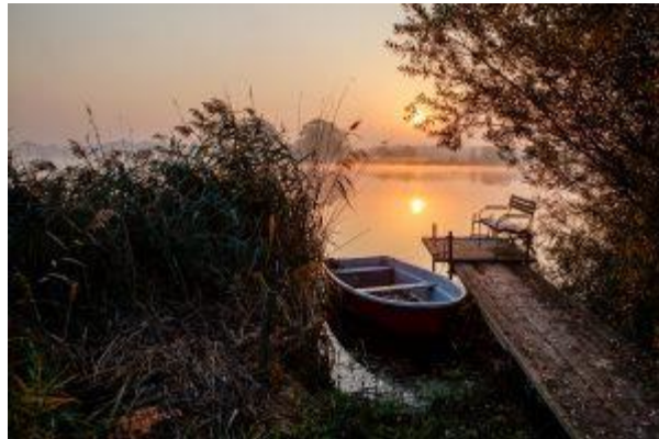
A boat at the lake

English (from my German translation of the original):