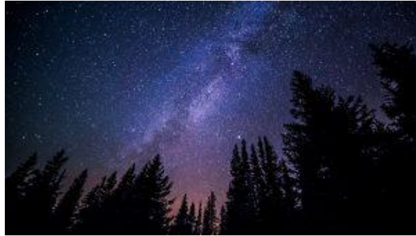
The Milky Way ( Freies Foto )