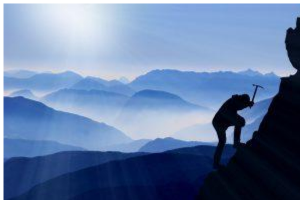
Climbing the mountain of freedom! ( Freies Foto )

They "throw" through the "Not-Seeing", the "Thirsts" and the "Inner Compulsions" or the "Afflictions" (Kilesas – like hatred, greed, envy, being uptight, lie, arrogance, or self-comparisons etc.) in the rotating "Wheel of Existence" of "Samsara" in an identificatory, fixating or grasping manner to the "outside".