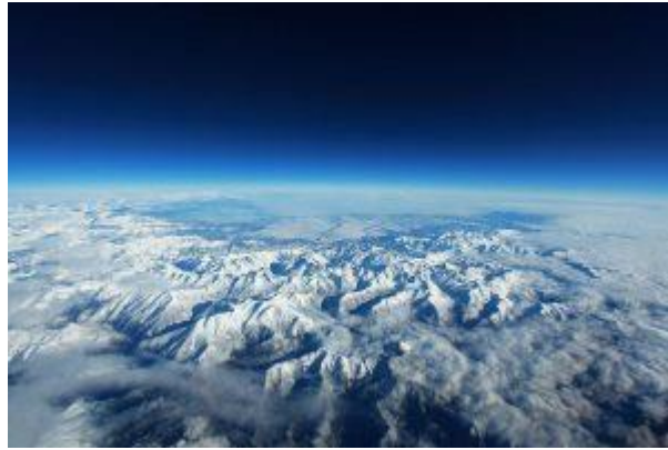
The Pyrenees ( Freies Bild )

Above in the skies, down in the earth, in every direction - unlimited, free from hatred or resentful feelings!