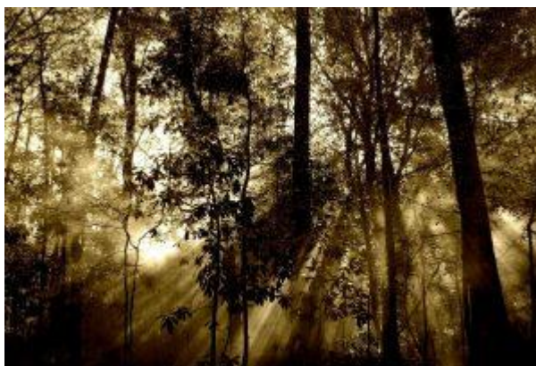
Light-flooded forest