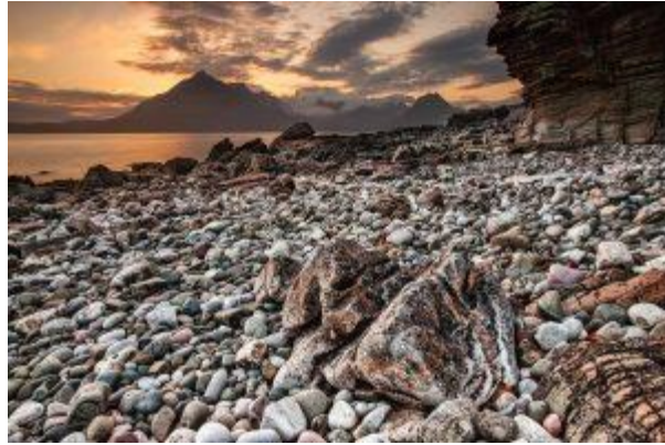
Der Wunsch der Psychopathen zu den Menschen ( Freies Foto )