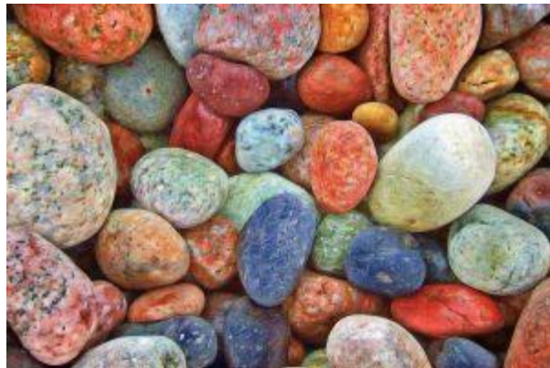
Die wahre Realität der menschlichen Individuen ( Freies Foto )